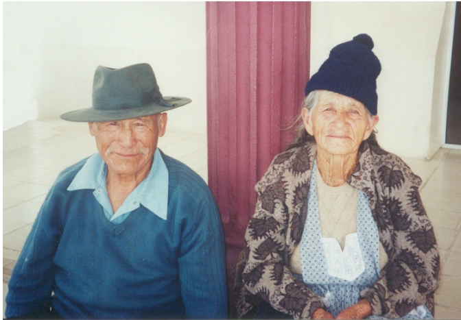
Waiting for the Clinic to Open